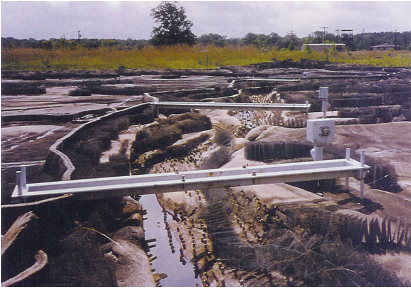
Fig. 1 The Mississippi River Basin Model

to flooding on the lower Mississippi (Robinson 1992). 2 A physical simulation of San Francisco Bay constructed in the 1950s and attempts to simulate the structure of levees and watercourses in New Orleans under the impact of Hurricane Katrina offer further examples of precisely this kind of isomorphism (Huggins and Schultz 1967, 1973, Interagency Performance Evaluation Task Force 2006). [Links to animations and further resources regarding many of the simulations referred to can be found at www.pgrim.org/hsf .]